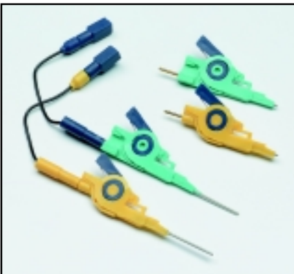
0.8-0.5mm Slim Body Microclips